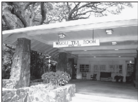
Waioli Tea Room