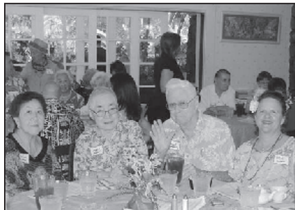
Good Fun & Good Friends

Were you one of the lucky attendees at last year's Annual Meeting? If so you'll remember what a great time we had ... wonderful ambience, delicious breakfast buffet, good fun with friends (you can't beat plant people). Because we received such positive feedback we've decided to do it again ... at the Waioli Tea Room, that is. In gorgeous and green Manoa Valley.