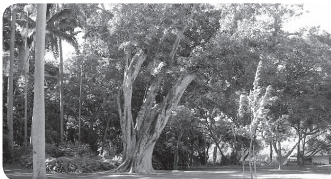
Foster Garden's Exceptional Bo Tree