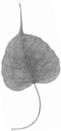
Loulu (From Page 1)